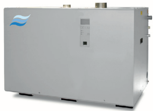
Condair’s SETC Humidifier