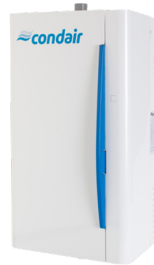
Condair HumiLife Proven Steam Solution Residential Humidifier

Together, Condair HumiLife and Cool Wave HVAC are spearheading a new standard of indoor air quality for the home. One installation at a time, more homeowners are discovering the health and wellness benefits Condair HumiLife can provide, not to mention long-term cost savings through temperature and relative humidity regulation.