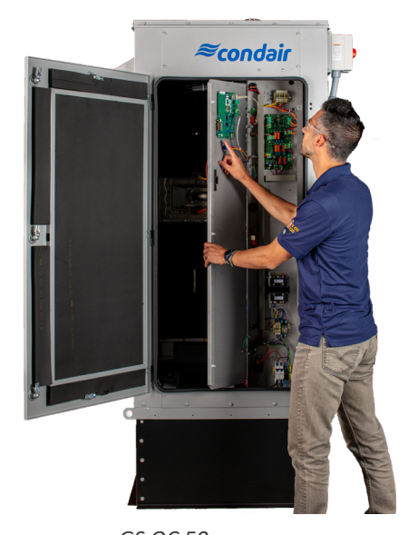
GS OC 50