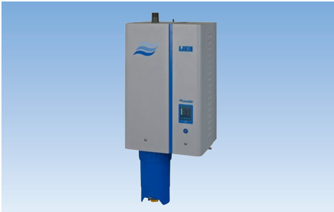
Nortec RS Series Resistive Steam Humidifier