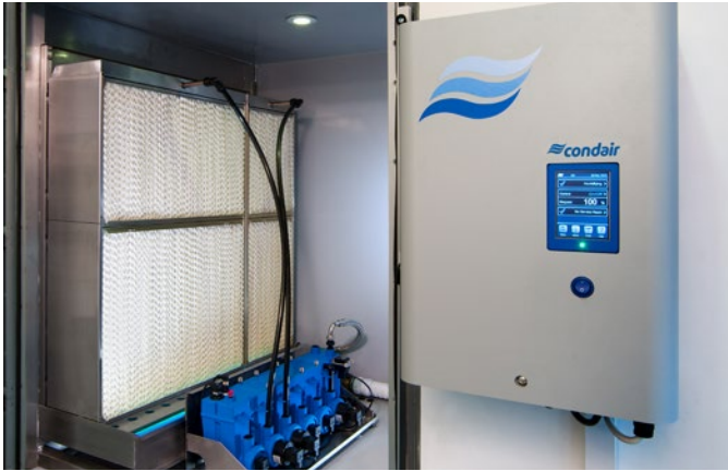
ME Series Media Evaporative cooling and humidification