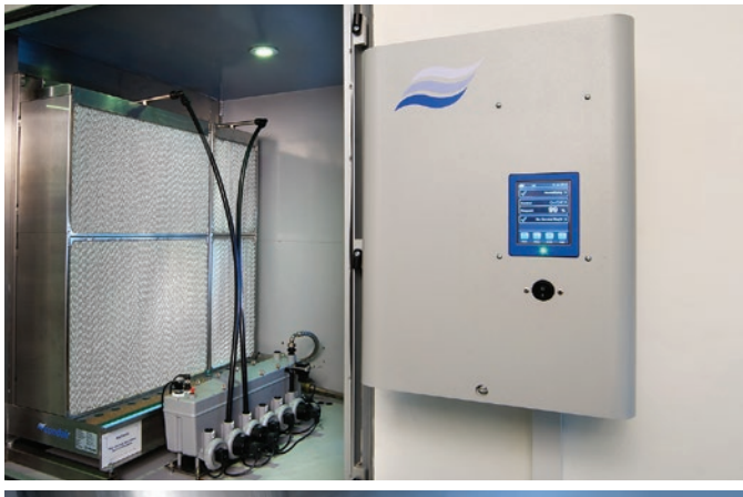
ME-Series Media Evaporative cooling and humidification

modular data centers, Nortec has the technology and expertise to provide the ideal solution.