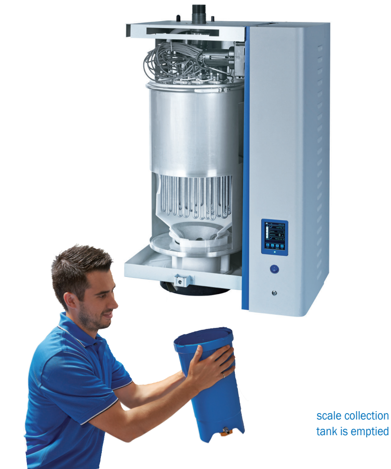
scale from the humidifier gravitates into the scale tank