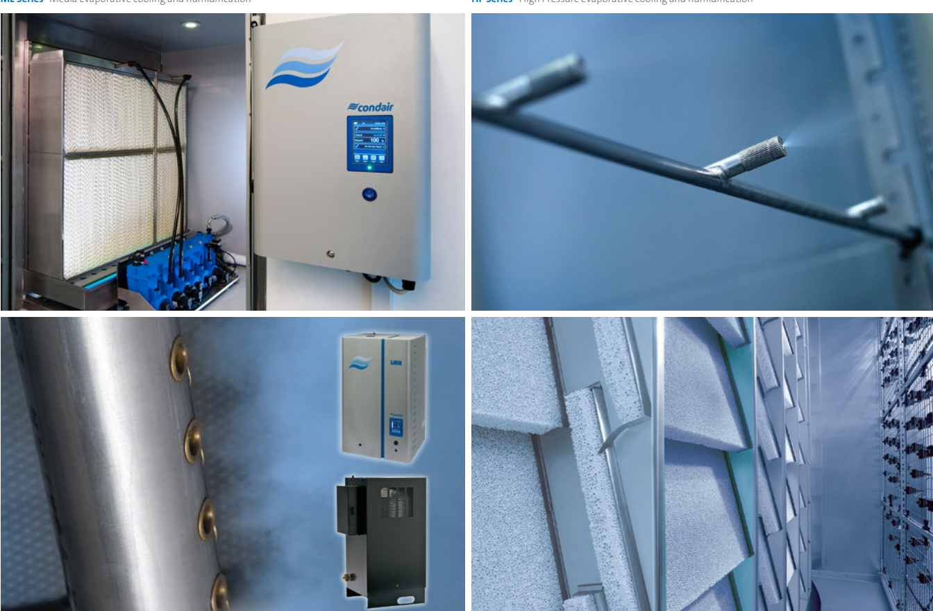
Nortec EL / MES-U Series Steam humidification

HP Series High Pressure evaporative cooling and humidification