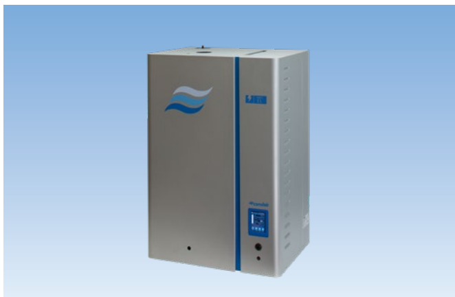
Nortec EL Series Electrode steam humidification

As a leading manufacturer of commercial/industrial humidification systems for more than 70 years, Condair has the technology and application expertise to meet the needs of any application.