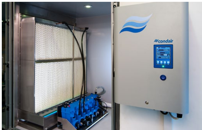
ME Series Media Evaporative cooling and humidification