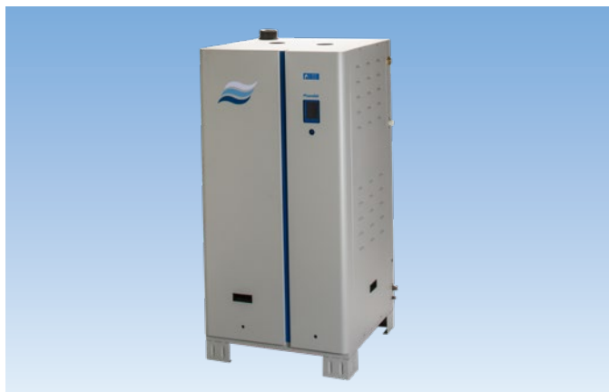
Nortec GS Series Gas-fired steam humidification