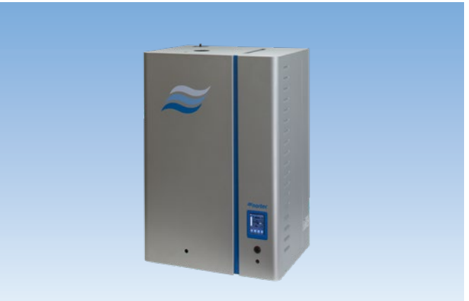
Nortec GS-Series Gas-fired steam humidification