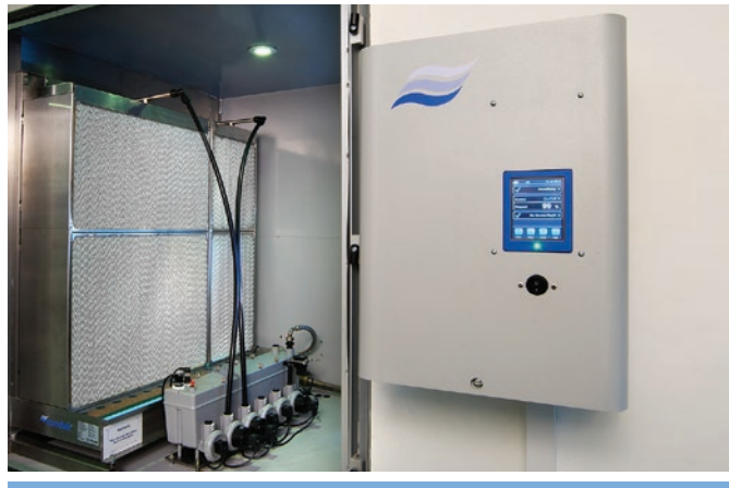
Nortec ME-Series Media Evaporative cooling and humidification

Condair also offers a wide range of associated products such as water treatment systems, air compressors, pumps and humidity monitors.