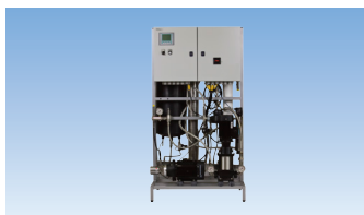
HP-Series High Pressure Humidification