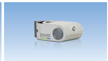
DR-Series Solo Direct Room Humidification