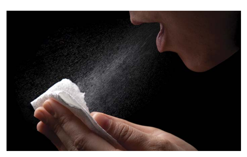
Droplets less than 4 microns expelled during breathing, speaking, coughing or sneezing can remain airborne and infectious for hours.

However, below the critical level of 40%RH, further evaporative moisture