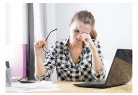
Sore eyes is a symptom of long term exposure to a dry atmosphere

When our mucous membranes dry out, this natural defence mechanism is inhibited, leaving us more susceptible to airborne infection from viruses and bacteria.