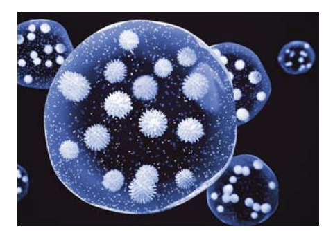
At above 40%RH, droplets remain larger and more fall to the ground, reducing airborne infection. For those particles small enough to remain airborne, their internal salts stay in solution and attack the germs, reducing their infectious capability.

The lower humidity also causes more droplets to evaporate down to a size capable of remaining airborne. So dry air has the double effect of creating a greater quantity of airborne droplets and prolonging the infectivity of the germs they carry, significantly increasing the potential risk of secondary infection.