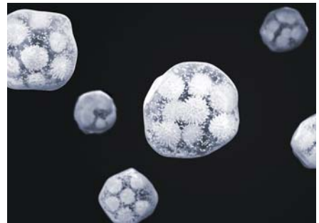
At below 40%RH, more droplets become smaller through evaporation and remain airborne, increasing the risk of infection. Internal salts crystallize out of solution and are no longer a threat to the transported germs, prolonging their infectivity.