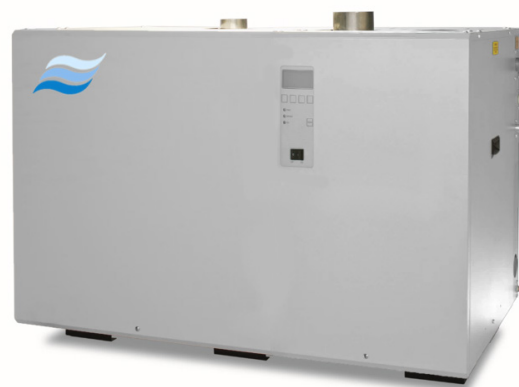
Condair's SETC Humidifier