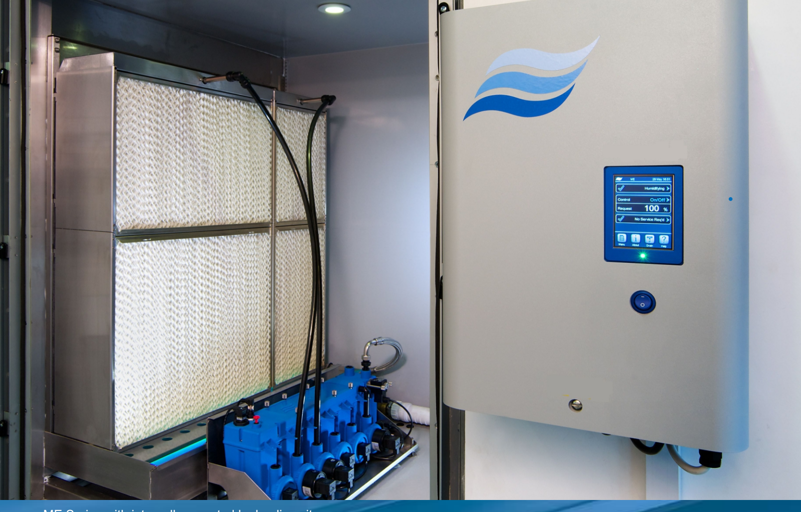
ME Series with internally mounted hydraulic unit