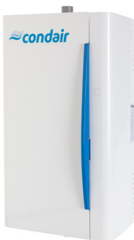
HumiLife RH In-Duct