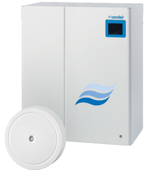
Condair MN unit and spray head.