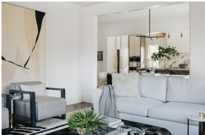
Storm Residence Living Room

“ The Condair MN Series flexible humidification system has been a game-changer for us. It allows us to enjoy our art and books without worrying about their preservation. The team’s expertise made the installation seamless, and we appreciate the ongoing support.