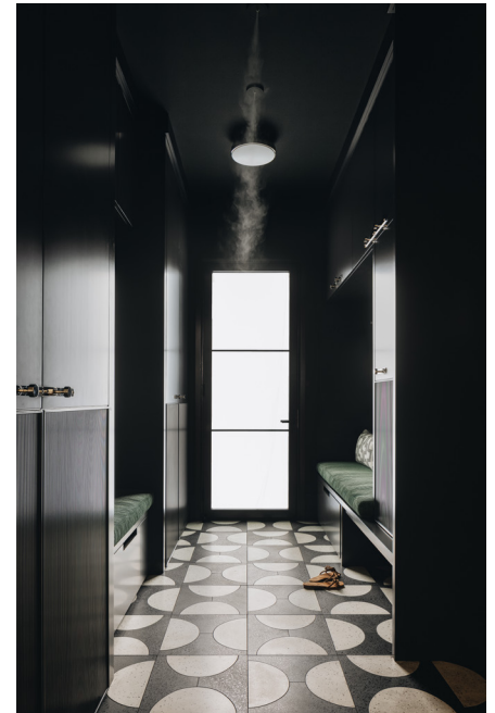
Storm Residence mudroom with custom painted Condair MN spray heads.

After careful consideration, Amy Storm chose the Condair MN flexible humidification system, recognizing that no alternative could provide the precision and flexibility required for their needs. The MN system utilizes a mesh nebulizer to generate humidity without traditional ductwork, perfectly complementing the home’s radiant heating and forced-air cooling systems.