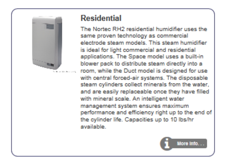
Figure 5: Residential Humidifiers

You will be redirected to the Product Catalog home page. This page contains a listing of all of the various humidification products offered by Nortec. For this tutorial, you require a RH2 Residential Humidifier. Scroll down the page until you locate the Residential listing as shown in Figure 5: Residential Humidifiers.