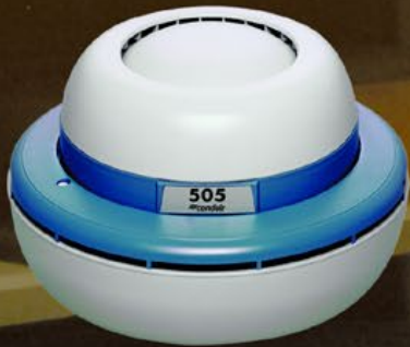
Condair 505: Simply universal

Horizontal or vertical? The deflector hoods supplied with this compact atomiser enable individual direction of a fine aero-sol mist absolutely free of droplets. The unit can be cleaned with a minimum of effort, and you can decide whether you wish to connect your Condair 505 to the mains water supply or, alternatively, utilise the manually-filled water tank.