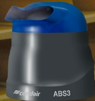
Condair ABS3: Double Strength

The Condair 3001 really comes into its own in industrial and commercial premises with a room volume of 500 m 3 . The deflector hood directs the aerosol mist exactly where you require it, as the outlet can be continuously adjusted. The Condair 3001 is equipped with a manually-filled tank, or fully-automatic operation is also possible (i.e. by connecting it to the mains water supply). The thermal overload switch deactivates the unit if the water level drops too low, ensuring maximum operating safety.