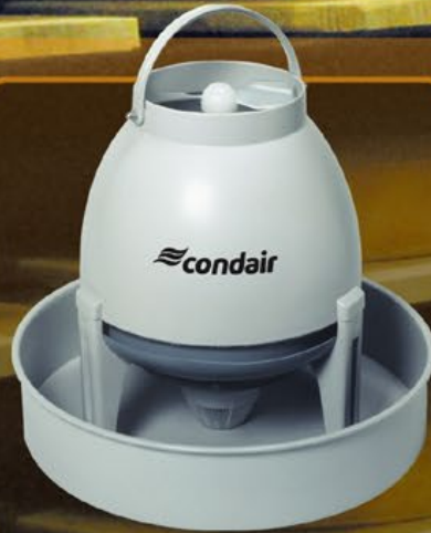
Condair 3001: Maximum safety

Horizontal or vertical? The deflector hoods supplied with this compact atomiser enable individual direction of a fine aero-sol mist absolutely free of droplets. The unit can be cleaned with a minimum of effort, and you can decide whether you wish to connect your Condair 505 to the mains water supply or, alternatively, utilise the manually-filled water tank.