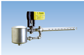
Nortec LS-Series Pressure steam humidification