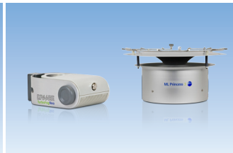
DR-Series Direct Room humidification