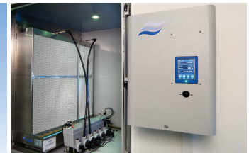
ME-Series Media Evaporative cooling & humidification

As the leading manufacturer of commercial/industrial humidification systems for more than 70 years, Condair has the technology and application expertise to meet the needs of any application.