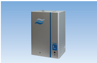
Nortec EL-Series Electrode steam humidification

Facilities and Operation Manager, Itron Inc.