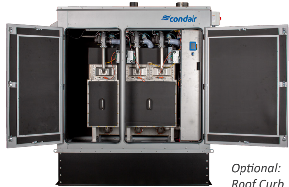
Optional: Roof Curb

The GS OC is designed to operate in temperatures up to 122°F. The unit also features extensive IP testing and has a rating of IP 55 for dust and water ingress protection.