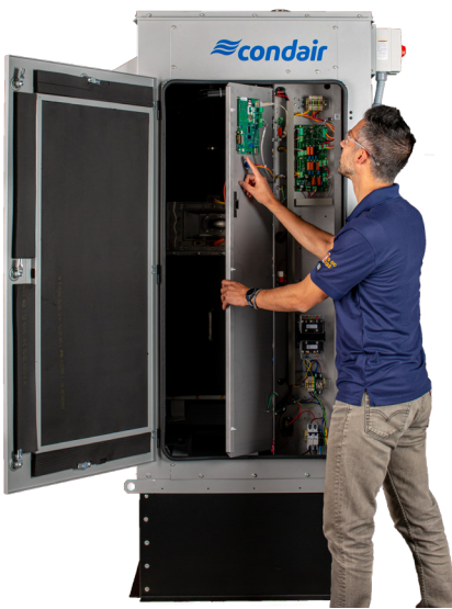
GS OC 50